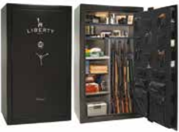
Liberty Safe Colonial 50 Black Gloss