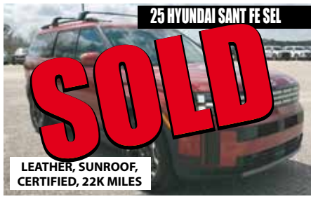
25 HYUNDAI SANT FE SEL