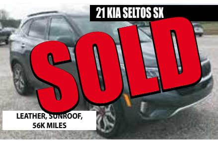
21 KIA SELTOS SX