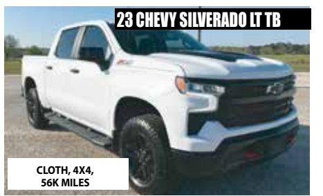
23 CHEVY SILVERADO LT TB