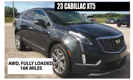
23 CADILLAC XT5