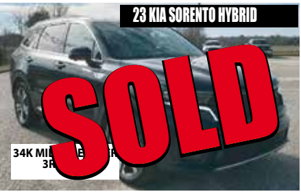
23 KIA SORENTO HYBRID