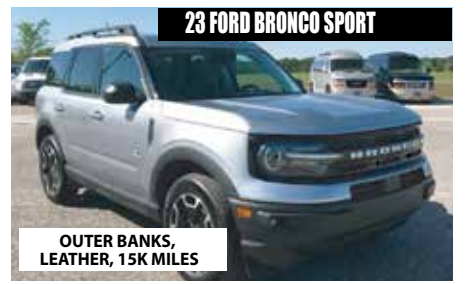
23 FORD BRONCO SPORT