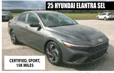
25 HYUNDAI ELANTRA SEL