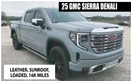
25 GMC SIERRA DENALI