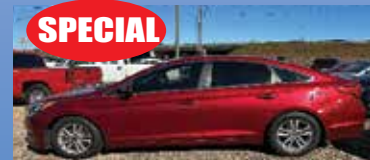
SPECIAL 15 HONDA SONATA $9,995 CLOTH, AUTO CASH