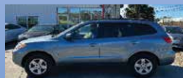
09 HYUNDAI SANTA FE $3,000 CLOTH, AUTO, SHARP DOWN