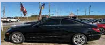
10 MERCEDES E350 $5,000 NICE RIDE! DOWN