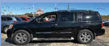
11 NISSAN ARMADA $3,500 PLATINUM, LEATHER, FULLY LOADED DOWN