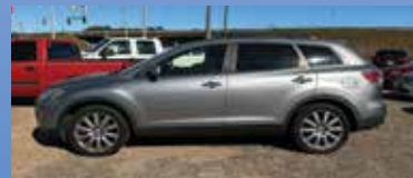
09 MAZDA CX9 $3,500 LEATHER, SUNROOF DOWN