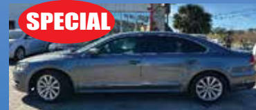
SPECIAL 13 VW PASSAT SEL $5,995 LEATHER, SUNROOF, LOADED CASH