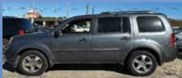
13 HONDA PILOT $3,000 LEATHER, SUNROOF DOWN