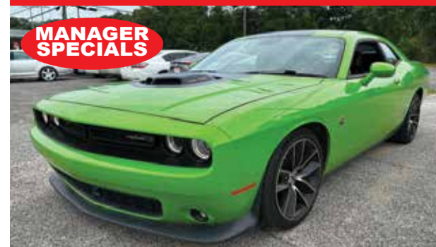
17 DODGE CHALLENGER