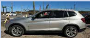
13 BMW X3 $3,500 MUST SEE!! DOWN