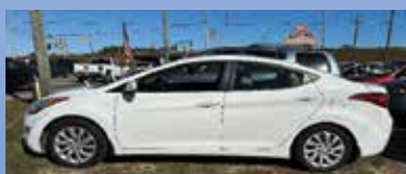
15 HYUNDAI ELANTRA $3,000 CLOTH, AUTO EXTRA CLEAN DOWN