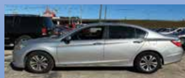
15 HONDA ACCORD $5,000 DOWN