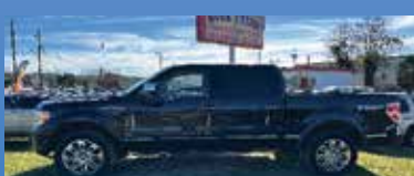
10 FORD F150 PLATINUM CALL FOR DETAILS LEATHER, SUNROOF, LOADED