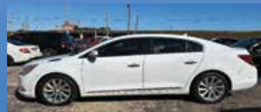
14 BUICK LACROSSE $4,000 LEATHER, AUTO, SHARP DOWN