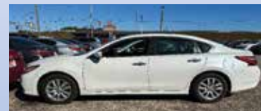
16 NISSAN ALTIMA $3,500 CHECK IT OUT! DOWN