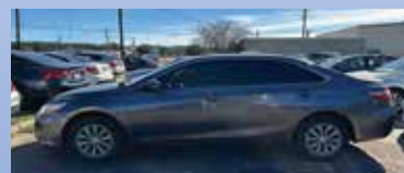
17 TOYOTA CAMRY LE $5,000 CLOTH, AUTO, EXTRA CLEAN DOWN