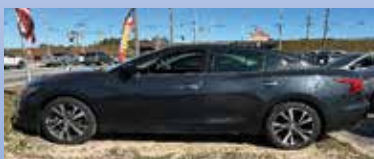
16 NISSAN MAXIMA CALL FOR DETAILS