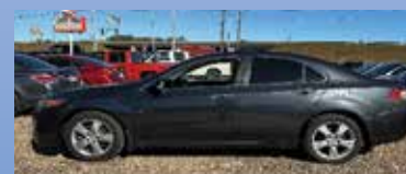
12 ACURA TSX $4,500 LEATHER, SUNROOF, LOADED DOWN