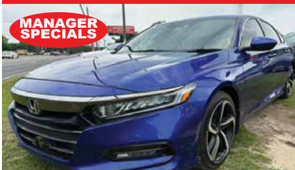
18 HONDA ACCORD SPORT