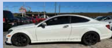
13 MERCEDES C250 $5,000 LEATHER SUNROOF, LOADED DOWN