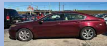
12 ACURA TL $5,000 LEATHER, SUNROOF DOWN