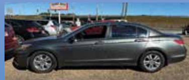
11 HONDA ACCORD $3,500 LEATHER, AUTO, SPORTY DOWN