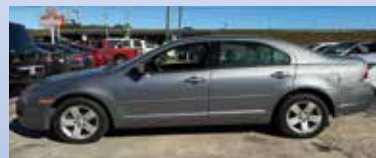
06 FORD FUSION $2,000 LEATHER, AUTO, EXTRA CLEAN DOWN