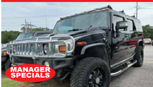
06 HUMMER H2

When Others Say No... WE SAY YES!!! CALL NOW!!! (251) 202-2271