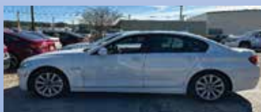
14 BMW 528i $3,500 LEATHER, SUNROOF DOWN