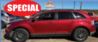
SPECIAL 08 FORD EDGE SEL $5,995 CASH