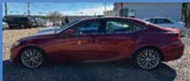
14 LEXUS IS250 $5,000 LEATHER, SUNROOF, LOADED DOWN