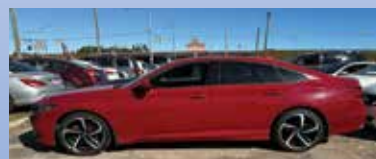
18 HONDA ACCORD $5,000 SPORT DOWN