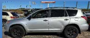
11 TOYOTA RAV-4 $3,500 4WD, CLOTH, AUTO, SHARP DOWN